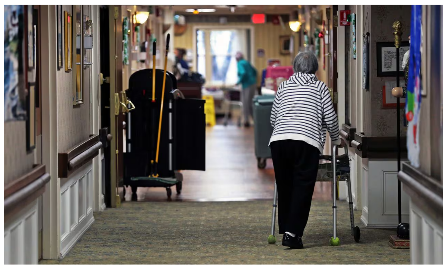
A hallway at Blaire House nursing home in Tewksbury.